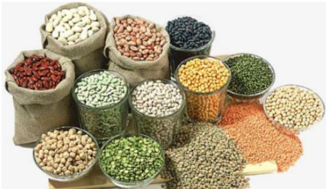
Agricultural and sideline products

Microwave hot air dehydrating drying machine for agricultural and sideline products Agricultural and sideline products are by-products brought by agricultural production, including agricultural, forestry, animal husbandry, deputy and fishing industries. They are divided into food, cash crops, bamboo and wood, industrial oils and paints, poultry products, silkworm silk, dried fresh fruit, dried fresh vegetables and condiments, medicinal materials, soil by-products, aquatic products and other major categories, each category is divided into several sub-categories. Plants include primary products of various plants that are artificially grown and naturally grown. Animals include primary products of various animals that are farmed and naturally grown.