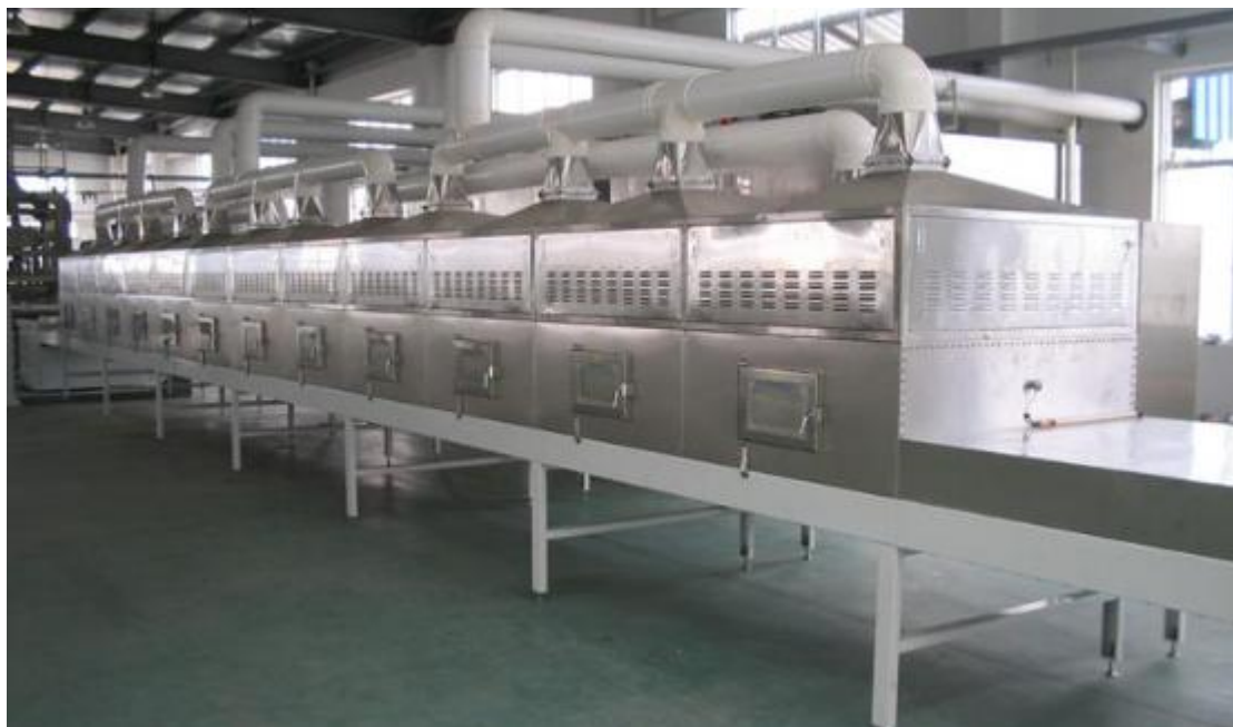
LD1504 agricultural and sideline products microwave hot air dehydration drying equipment

The vegetable microwave dryer adopts tunnel structure and PLC system. It is equipped with hot and cold air and infrared temperature measurement. It can monitor the material condition in real time and work in the assembly line, which greatly enhances the connection of the whole production process. The equipment is mainly made of stainless steel plate, which has strong heat insulation performance and corrosion resistance, strong and firm, long service life and reduced equipment damage.